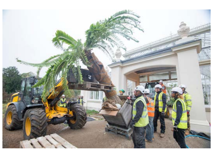
A team effort to move the Encephalartos woodii back into the Temperate House

One of our most important specimens, Encephalartos woodii , which is extinct in the wild, has now been brought back into the Temperate House, and planted into its final position in the South Block.