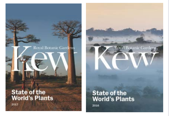
The first two issues of the annual State of the World's Plants report

The second octagon will be themed around the State of the World's Plants Report, Kew's annual publication which analyses data to describe the state of plants globally, global threats to plants, gaps in information, and priorities for research and conservation. This report and its findings will highlight the most rare and threatened plants and how our work in Kew science is helping to address these concerns.