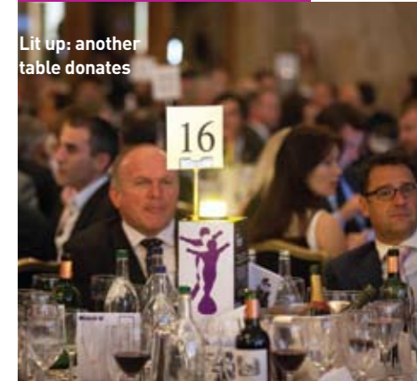
Lit up: another table donates